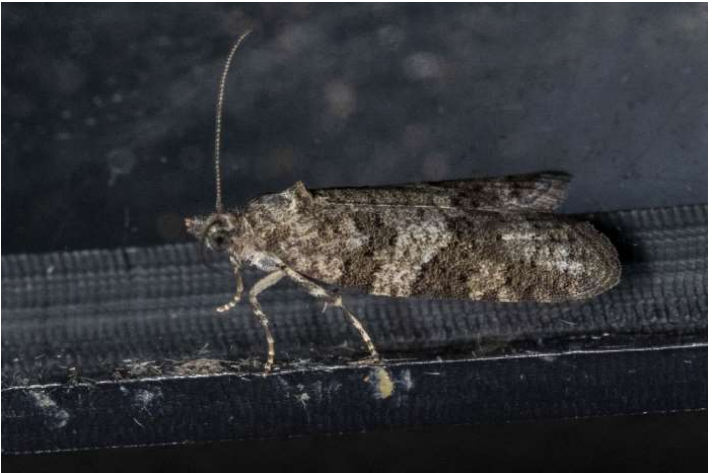
Light grey tortrix Cnephasia incertana