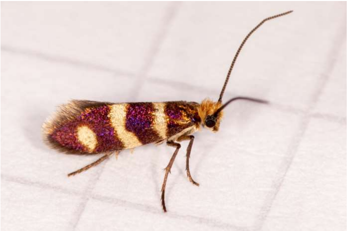
Yellow-barred pollen-moth Micropterix aureatella