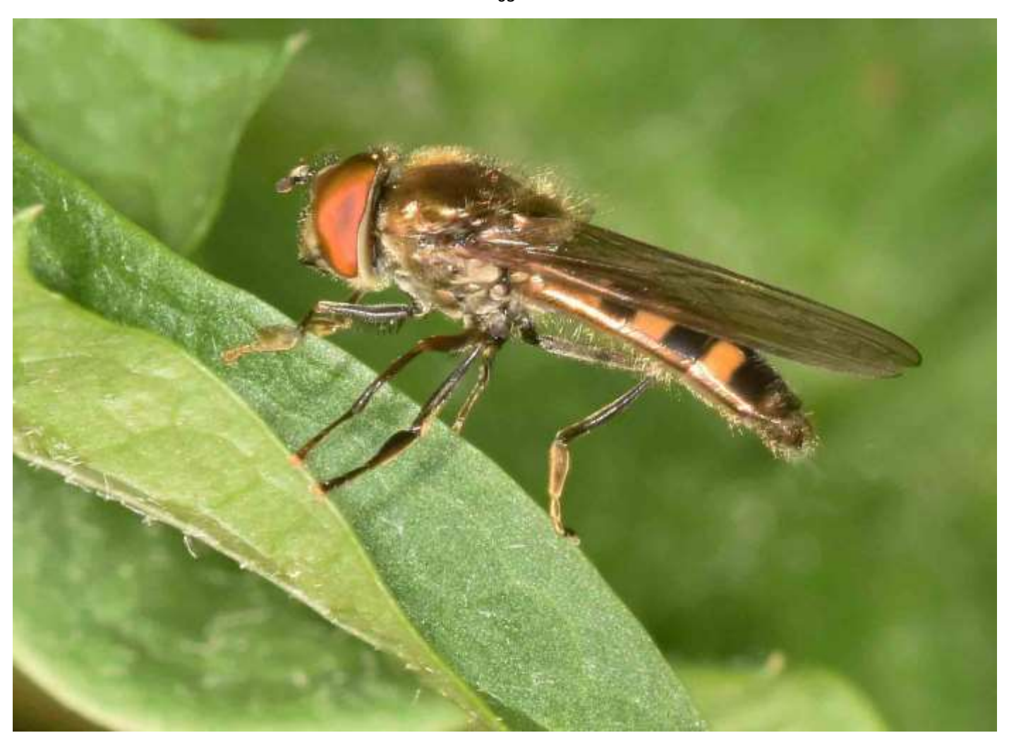
White-spotted sedgesitter Platycheirus peltatus

Another widespread species , or rather group of species, of Platycheirus. These males were at Gaddon Loch.