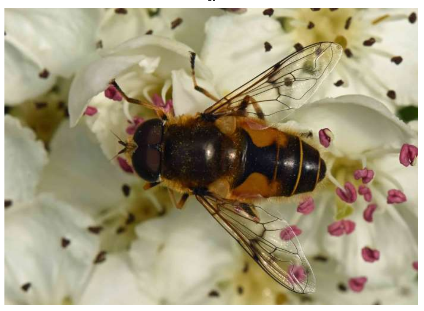
Stripe-winged drone fly Eristalis horticola

Similar to the previous species, but usually larger, and with a distinct stripe in each wing, and a stripe on the face.