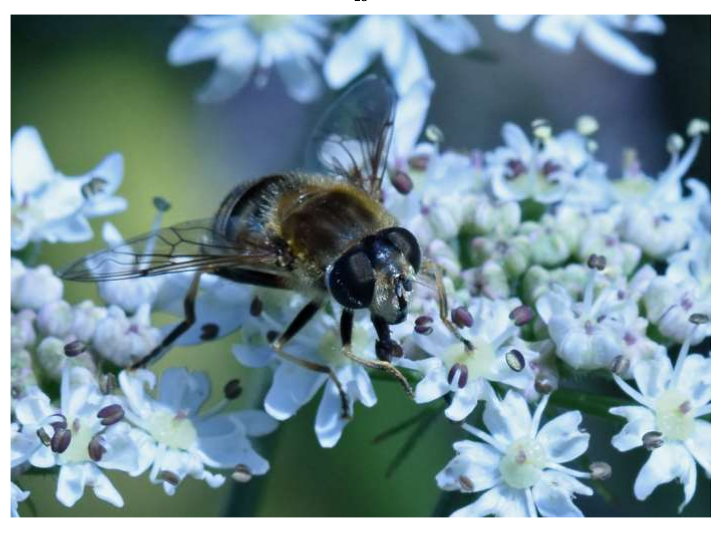
Stripe-faced drone fly Eristalis nemorum

Another common drone fly, which can be numerous at Gaddon Loch.