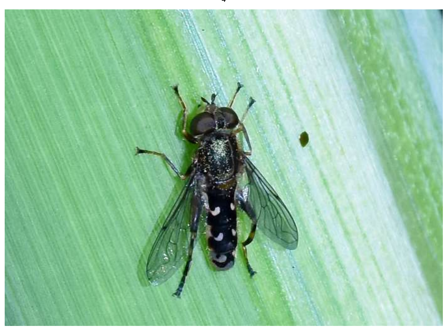
Waisted swamp fly Anasimyia contracta

These individuals were at Birnie Loch in summer 2019.