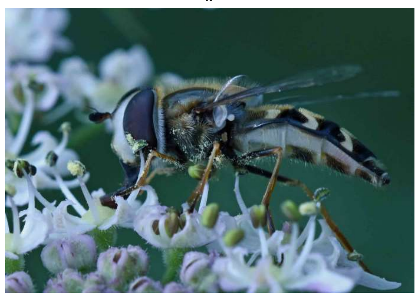
White-bowed smoothwing Scaeva pyrastri