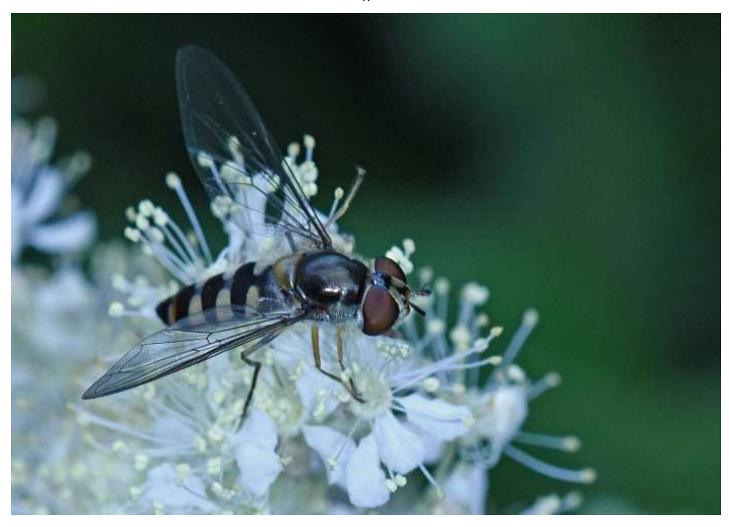
Spotted thintail Meliscaeva auricollis

A widespread species, but seldom encountered at Birnie and Gaddon Lochs. The male below was at Gaddon Loch on 1 August 2019, and the female above at Birnie Loch on 4 August 2019.