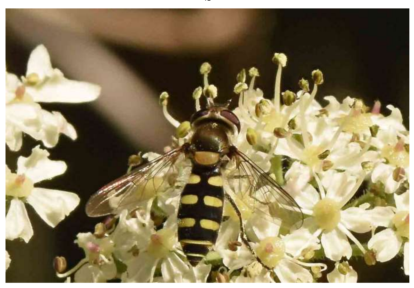
Matt-backed halfband Melangyna compositarum

A scarce mid-summer species. These females were at Gaddon Loch in July 2018.