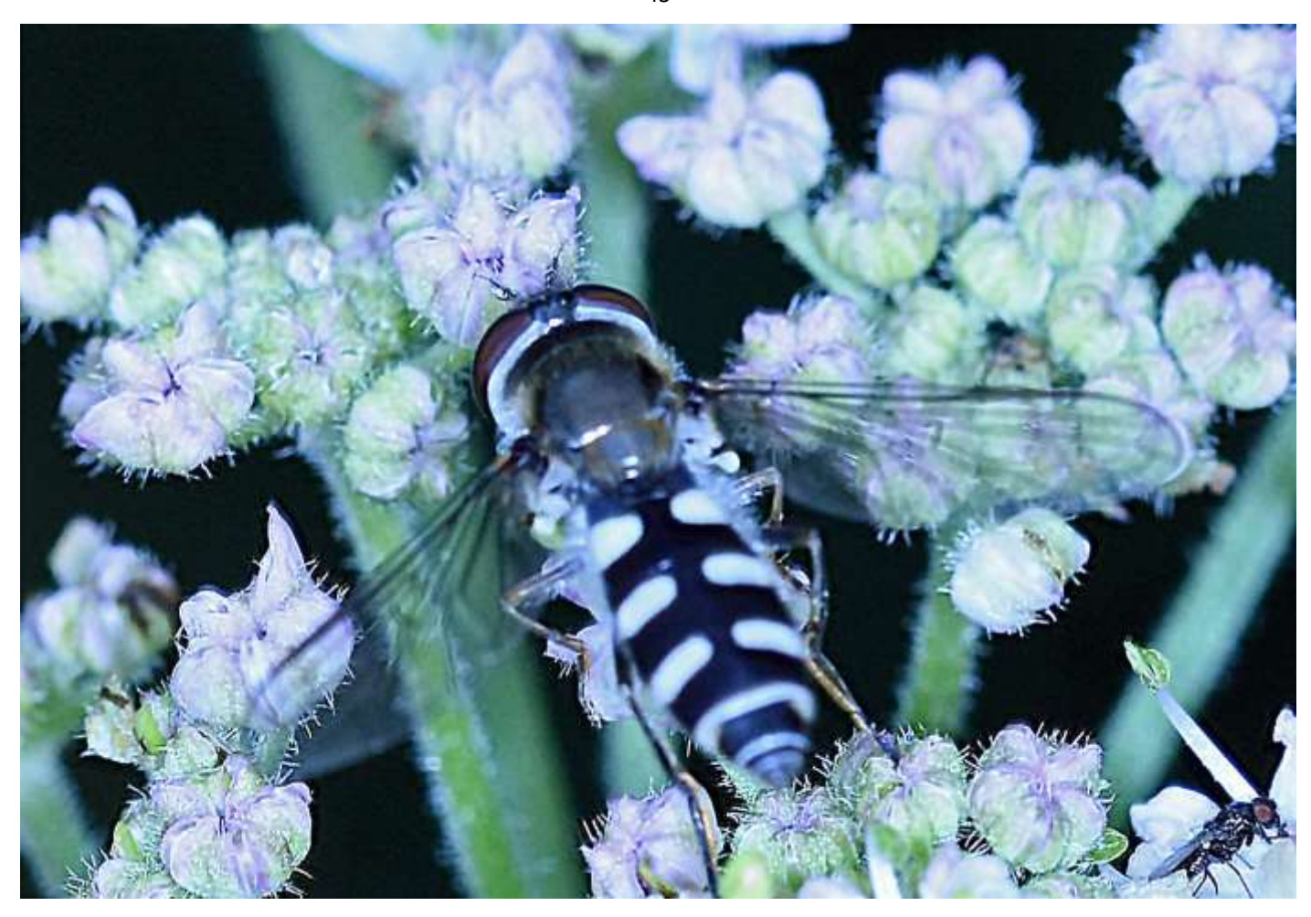
Shiny-backed halfband Melangyna umbellatarum

An uncommon species. Slightly out-of-focus shots of a female at Gaddon Loch in early August 2019.