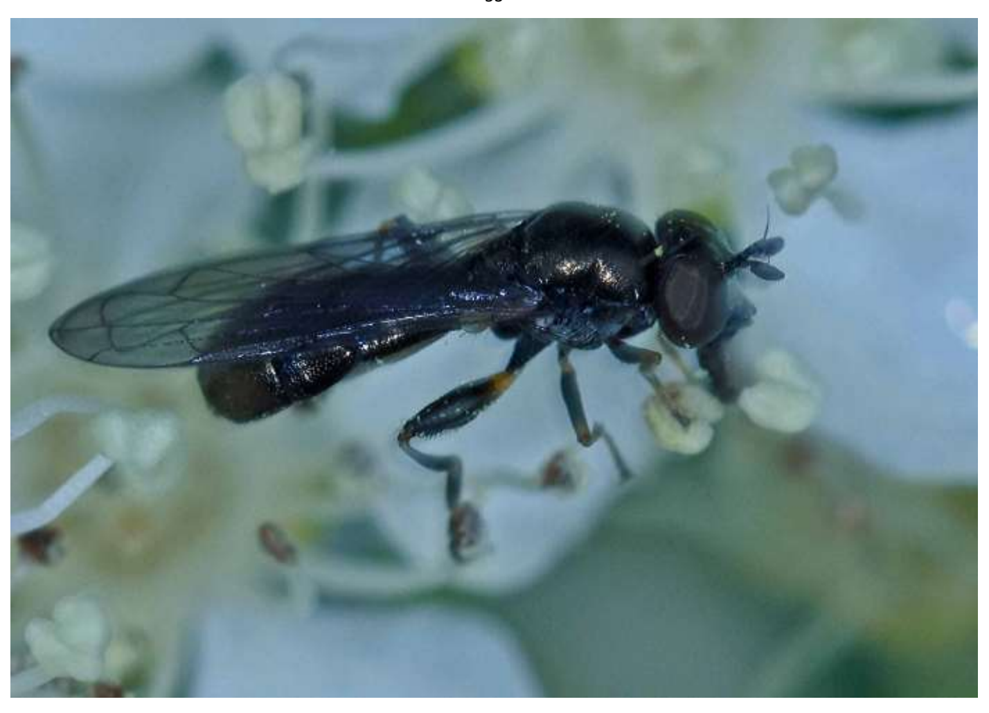
Black-kneed fen fly Neoascia tenur

This species can be common in wet habitat. This male was at Birnie Loch.