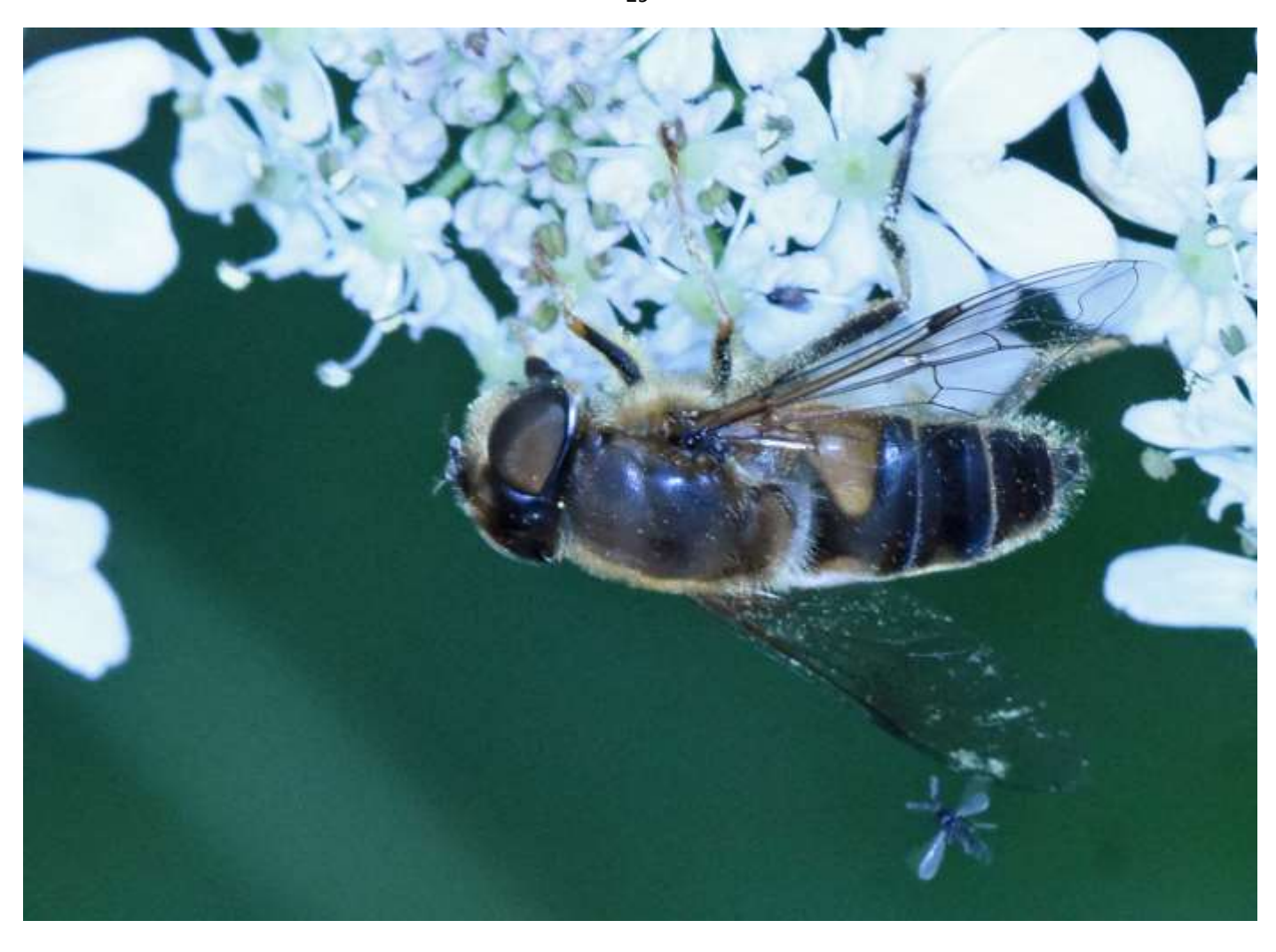
Tapered drone fly Eristalis pertinax

A large, widely-distributed drone fly. Female above, male below.