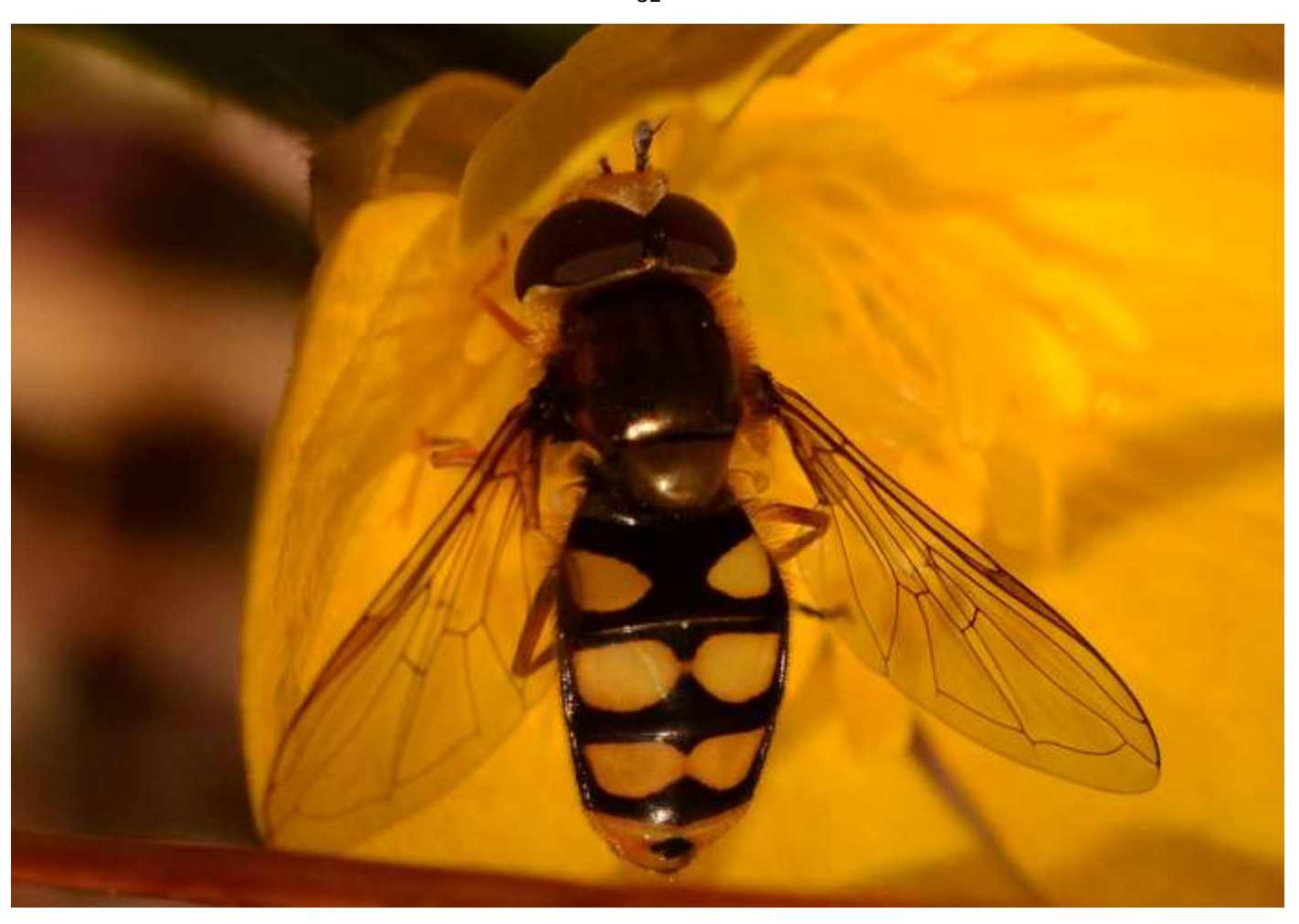
Broad-banded aphideater Eupeodes latifasciatus

Fairly small hoverfly with variable markings.