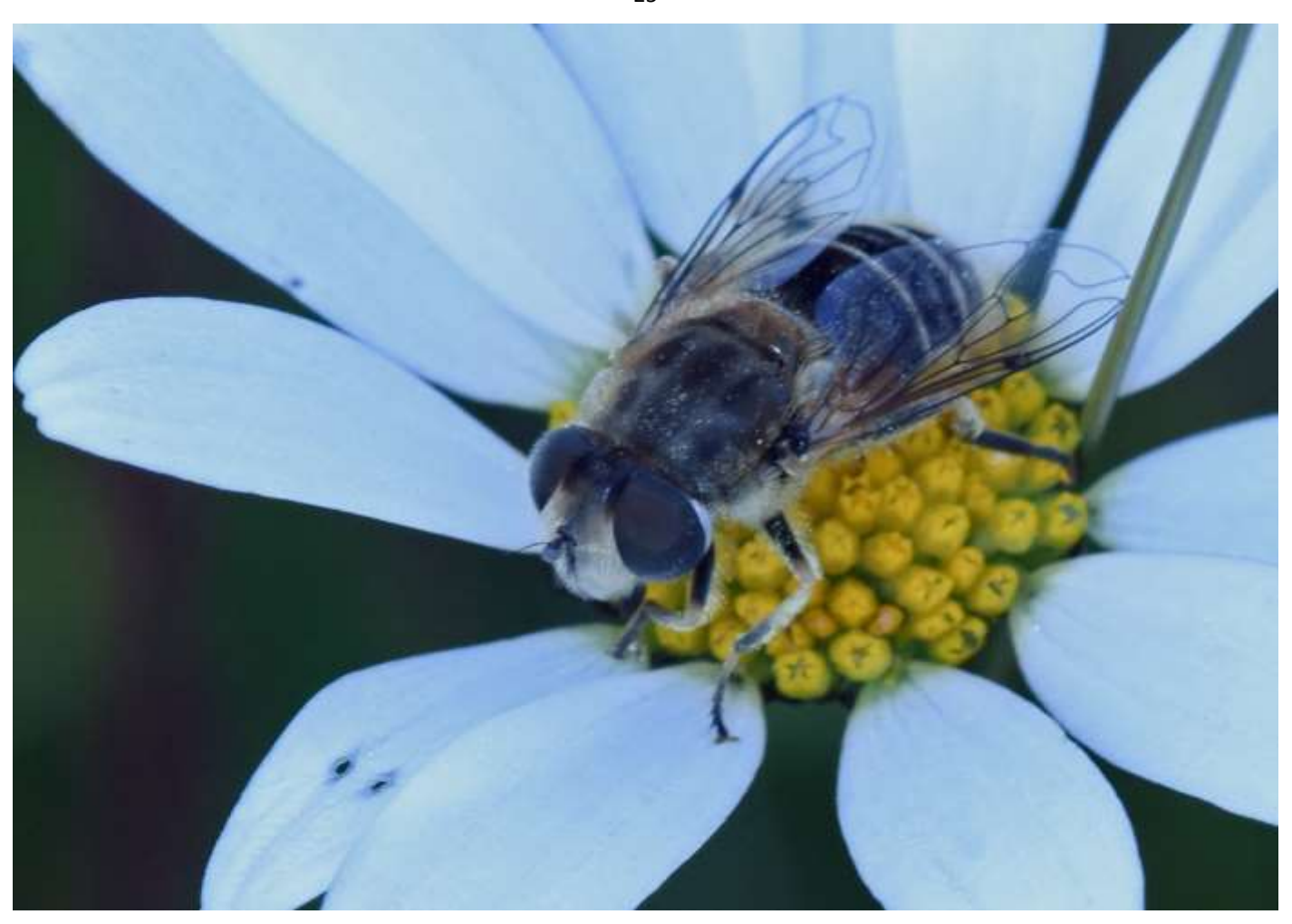
Eurasian drone fly Eristalis arbustorum

A widespread drone fly. This is a female.