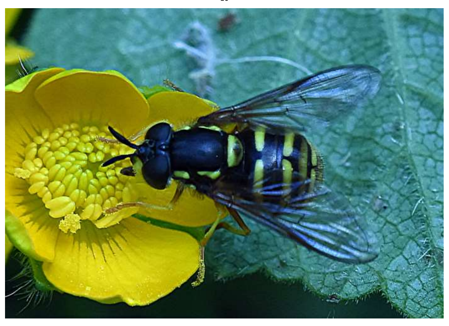
Little meadow fly Chrysotoxum arcuatum

Uncommon in the Howe of Fife. This female was at Gaddon Loch in early July 2020.