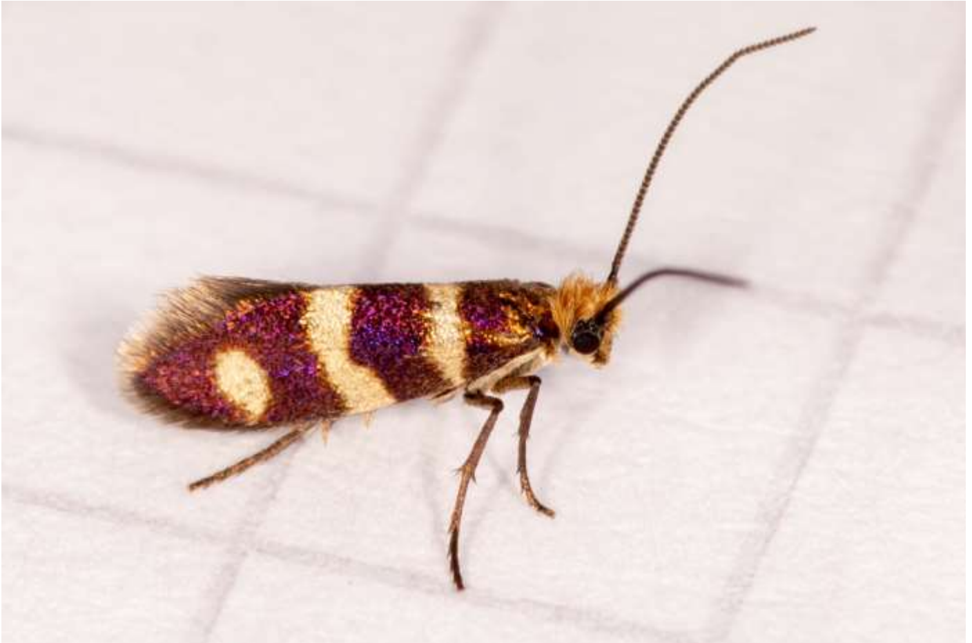
Yellow-barred pollen-moth Micropterix aureatella