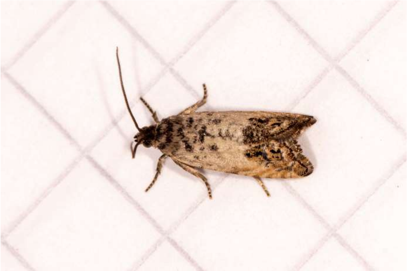
Common gorse moth Cydia ulicetana